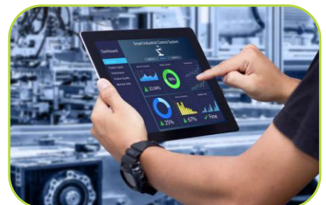
Energy Monitoring System