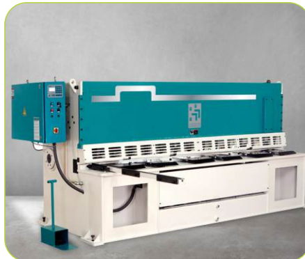
Precise Sheet Cutting