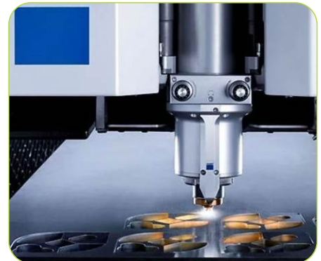
Laser Cutting Facility*