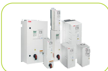
AC - DC Drives