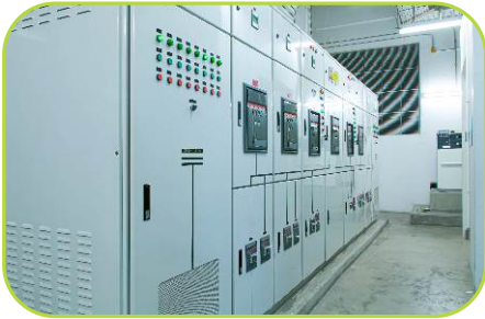
MCC & PCC Panels

One Stop Solutions for all Engineering Services in Electrical and Automation