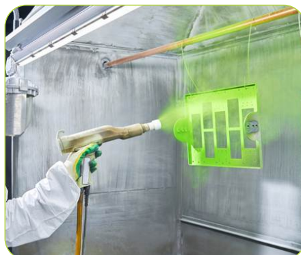
High Quality Powder Coating