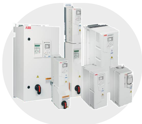
Drives & Automation