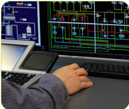
Design and Research